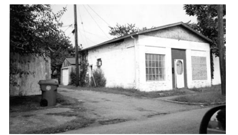
"Sugar Bowl" near Highland School