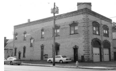
Hilltop Fire Station